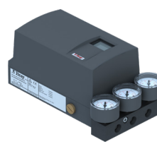
POSITIONERS Series 6A and 6A Explosion Proof