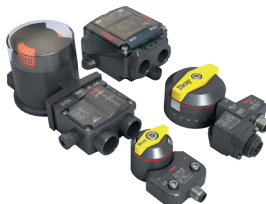
PROXIMITY SENSORS Series 54