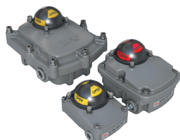
VALVE STATUS MONITORS Series 5A | 5B | 5C

Add to the versatility of the S98C by choosing the applicable accessories from Bray's complete line of positioners, status monitors and solenoids. The combination of actuators and accessories offer the best compatibility, economy and quality performance in the flow control industry.