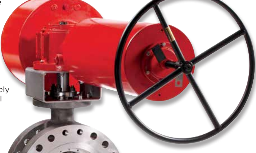
12" ASME Class 600 Double Flange ISO 5752 Face-to-Face Stainless Steel with Spring Return Actuator

The quarter turn design provides for low emission stem sealing and simplifies actuation requirements for on/off, modulating, and ESD applications. The valve is inherently fire-safe and fire-tested. Tri Lok's uniquely designed field replaceable seat and seal ring minimizes downtime and insures a lower cost of ownership.