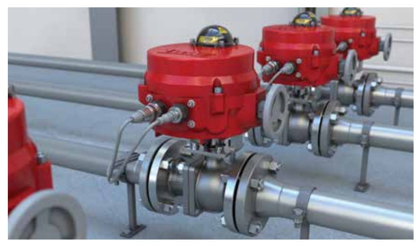
Typical installation of Series 70 DeviceNet Actuator