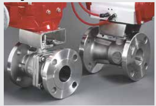
F15/F30 - RF15/RF30 Series Valves

Flow-Tek flanged ball valves are ideal for industrial applications. Larger F15/F30 valves feature ball suport.