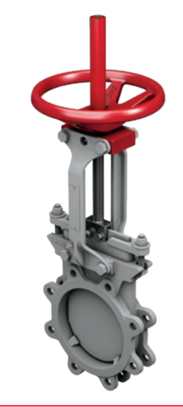
Direct Mounted Handwheel