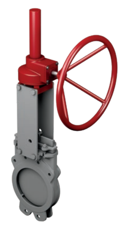
Bevel Gear Operator